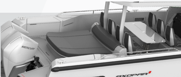
Picture shown with optional Sun deck cushions