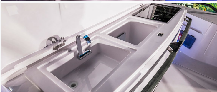
Picture shown with optional Flameless gas ceramic cooktop